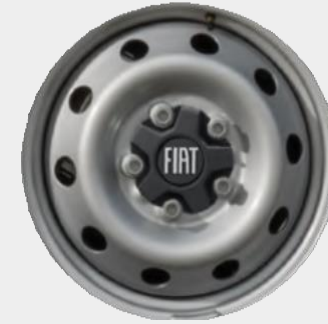
15" steel wheels with half wheel cover Standard on Ducato Light Van