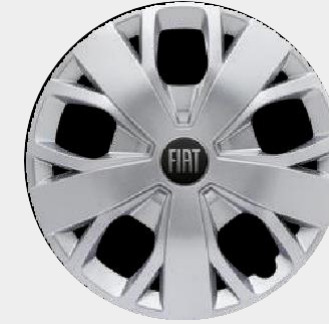
16" steel wheels with fullsize wheel cover Standard on Ducato Maxi Van