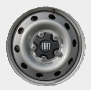
15" steel wheels with half wheel cover Standard on Ducato Light Van