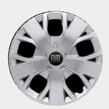
16" steel wheels with fullsize wheel cover Standard on Ducato Maxi Van